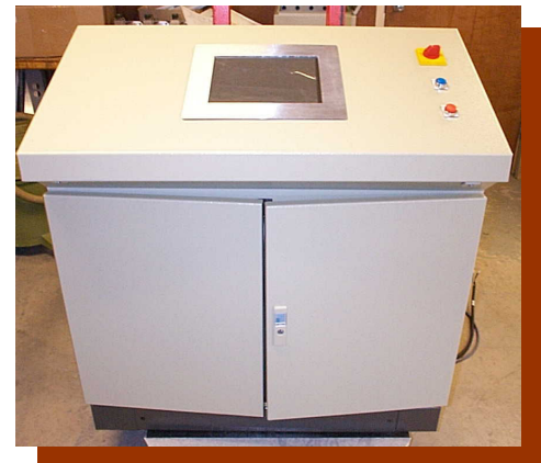
Multi-Needle Control System Enclosure

Either system upgrade program can be applied to the following multi-needle quilting machines manufactured by Gribetz International: