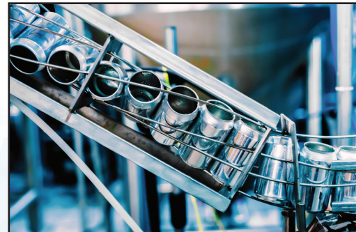
Automated Production of Beverage Cans

Our comprehensive product line emphasizes power, speed and accuracy. Connectivity options provide an ability to integrate with a variety of equipment used in automation systems.