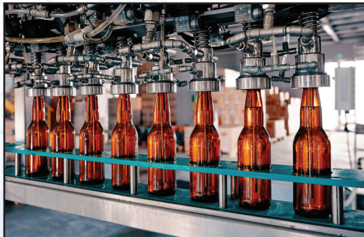
Bottle Filling Production Line

Discover multiple examples of systems that provide solutions to a variety of practical industrial applications. Check out methods used in producing products related to printing, packaging, metal fabrication, sewing, food processing and medical device manufacturing industries.