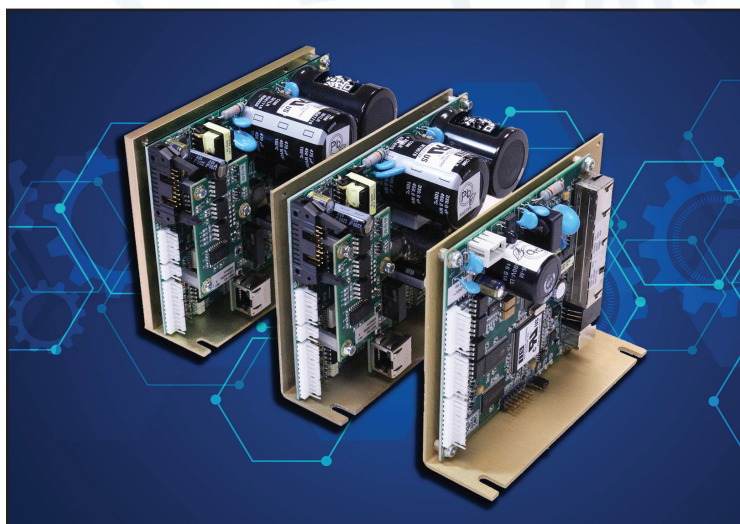
Luminary Servo Drives