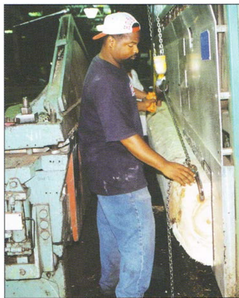
A worker can mount a flitch to the moveable table using either hydraulics or a vacuum process. The servocontrolled carriage with the attached knife blade is visible to the left.

A pair of hydraulic servovalves, one at each end of the blade, control