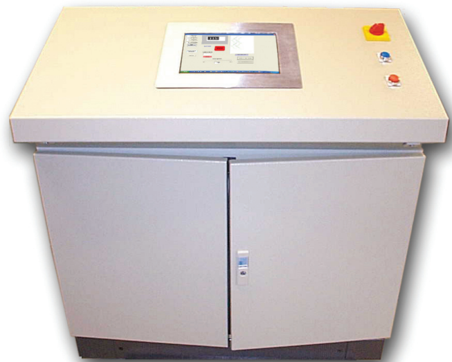
Program B - Multi-Needle Control System Enclosure

Call us today at (585) 924-9181 to discuss these programs in greater detail