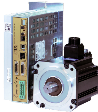
Program A - Single Axis Upgrade Kit

Our system upgrade options also include machines manufactured by EMCO, PATHE, MECA and MAMMUTH. If your machine is not on the list, please contact us, we can help you out.